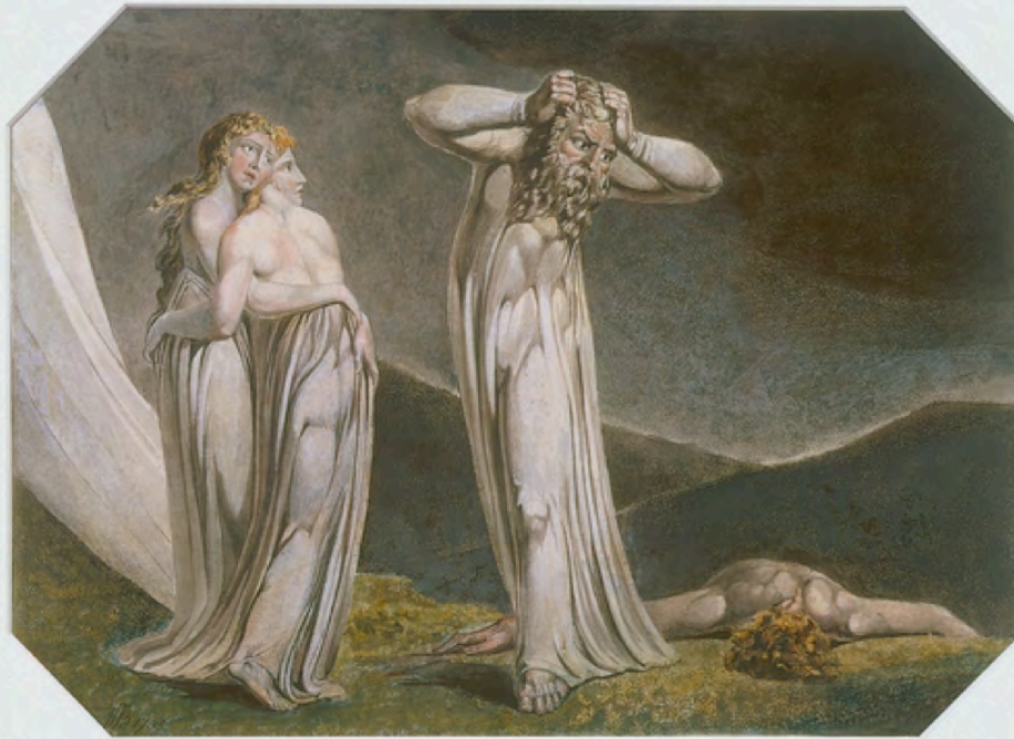
William Blake, 1757-1827: Lamech and His Two Wives , 1795

Just as the life of Enoch can be regarded as a type of the spirit of consecration, so Lamech, who also lived in the seventh generation from Adam, serves as a scriptural example of its antitype. While Enoch and his people covenanted with the Lord to ensure that there would be “no poor among them,” 88 Lamech “entered into a covenant with Satan” 89 to guarantee that he would never find himself as one of the poor. Lamech’s “secret works” contributed to the rapid erosion of the unity of the human family, culminating in a terrifying chaos where “a man’s hand was against his own brother, in administering death” and “seeking for power.” 90