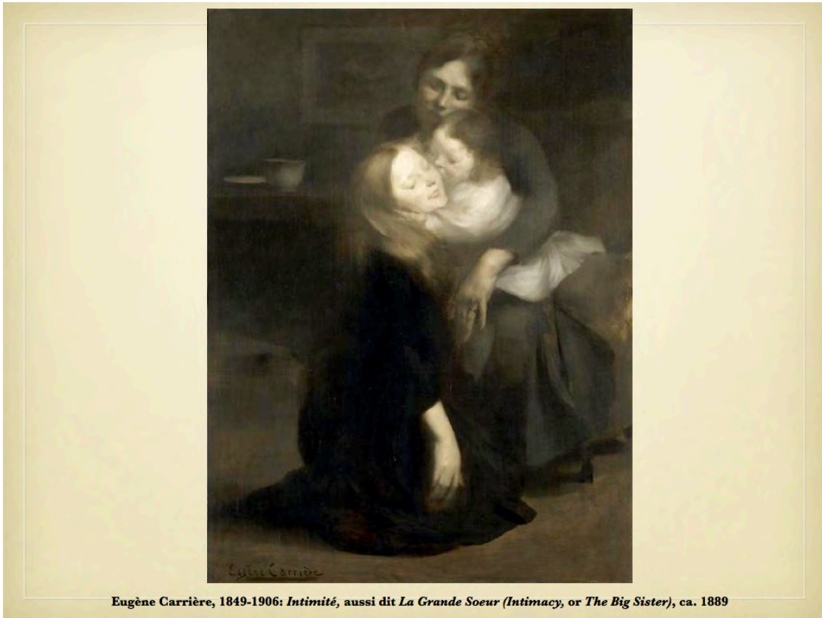
Eugène Carrière, 1849-1906: Intimité , aussi dit La Grande Soeur ( Intimacy , or The Big Sister ), ca. 1889

Therefore, sanctify yourselves that your minds become single to God, and the days will come that you shall see him; for he will unveil his face unto you, and it shall be in his own time, and in his own way, and according to his own will. Remember the great and last promise which I have made unto you. 100